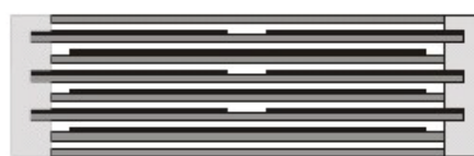
Extended metallized film design with internal series connection (series connection of elements)