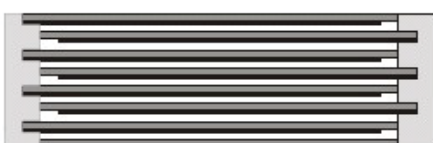
Extended metallized film design

Obtained by rolling process with a stated number of different types of films or films and metal foils, having characteristics, arrangement and sequence function of design targets, in order to obtain cylindrical rolls called windings.